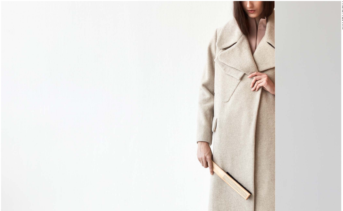
The holistic design process tested in the research project Circular Design Speeds results in products sold by the project's collaboration partner, Filippa K. The coat shown in the photo is made of recycled wool.