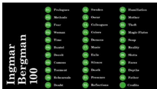
Picture 2 Choose the film you want to watch by clicking on the number or title.