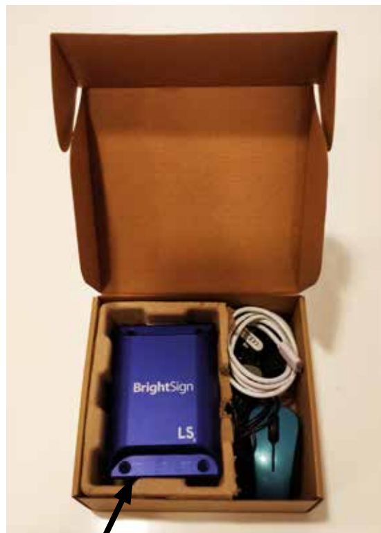
Media player on top