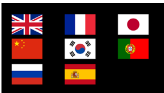
Picture 1 Start up screen, choose preferred language

After language has been chosen the start screen will be picture 2, here you click on the number of the film you want to watch.