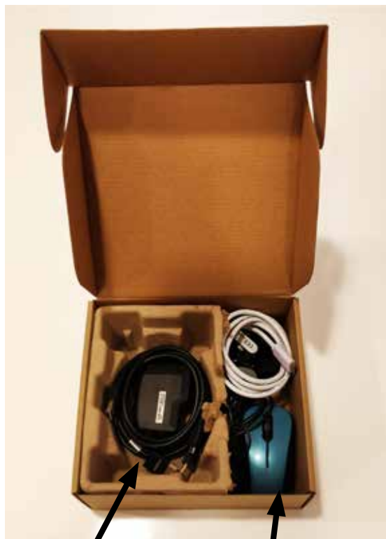
Power adaptor, power cable and HDMI-cable