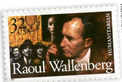
A US Postal Service stamp commemorating Raoul Wallenberg.

Searching for Raoul Wallenberg is a network of independent researchers trying to determine what happened to him. They believe there are many unanswered questions that warrant a thorough investigation before the question of Wallenberg's fate can be laid to rest. raoul-wallenberg.eu