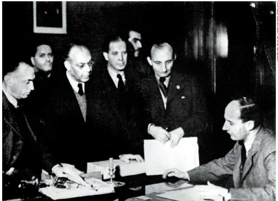
Raoul Wallenberg (right) surrounded by colleagues in Budapest, 1944.