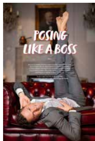
60 x 90 cm