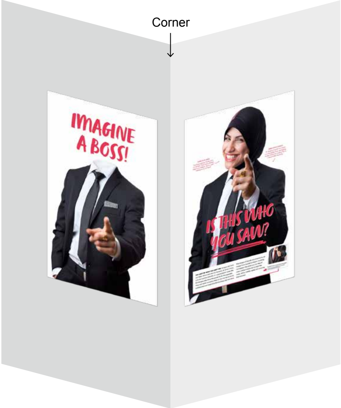
Example 1: corner

If possible hang poster 10 in a way so it is not immediatly visible from poster 9. Se examples below.