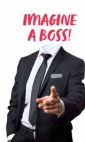
60 x 90 cm