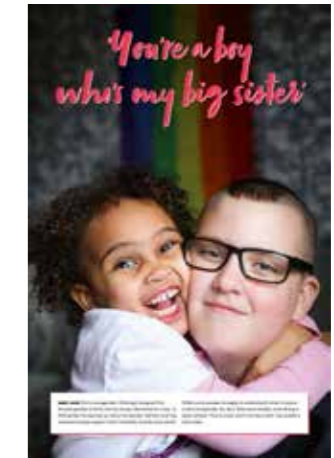
60 x 90 cm