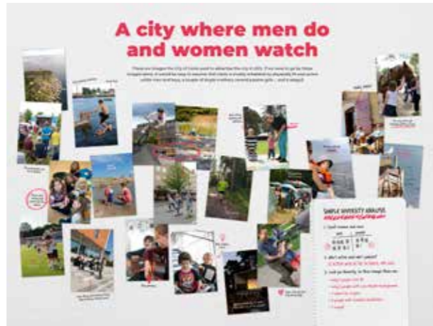
120 x 90 cm