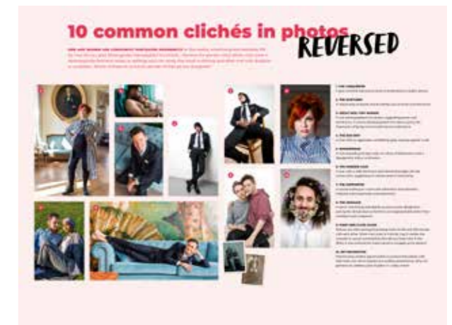
120 x 90 cm