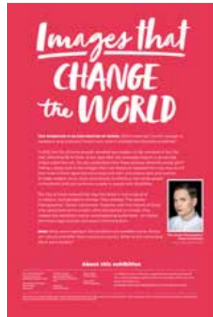
60 x 90 cm