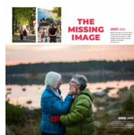
90 x 90 cm