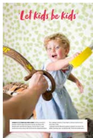
60 x 90 cm