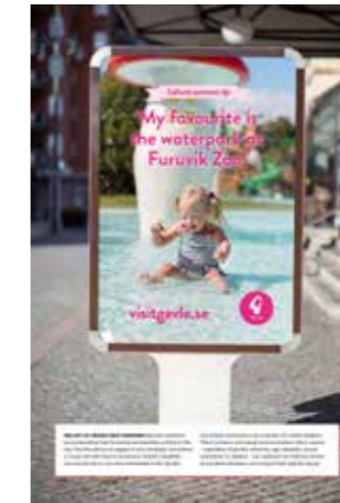
60 x 90 cm