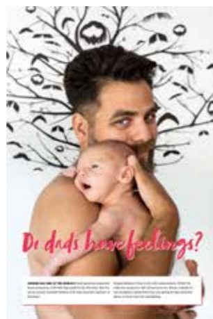
60 x 90 cm