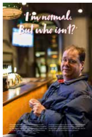
60 x 90 cm