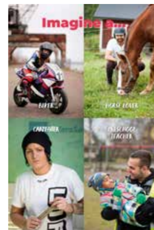
60 x 90 cm