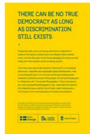
60 x 90 cm

See special hanging instructions for poster 9 and 10 on the next page.