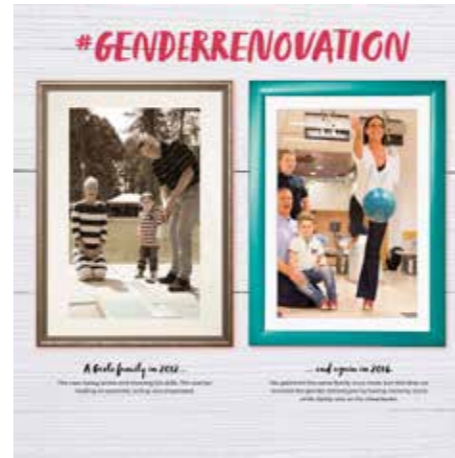
90 x 90 cm