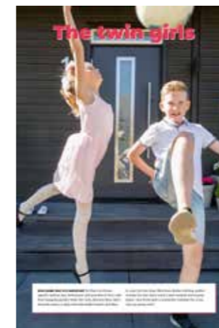
60 x 90 cm