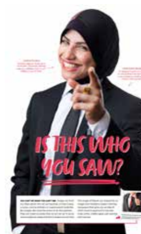
60 x 90 cm