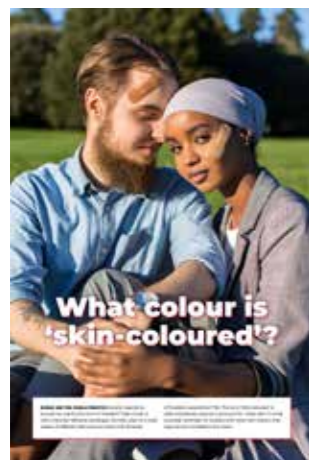
60 x 90 cm